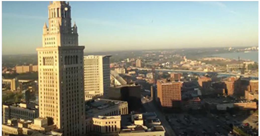
Cleveland, Ohio.

FRONT International Cleveland Triennial for Contemporary Art 1460 West 29th Street Cleveland, OH